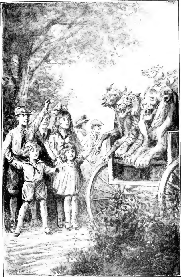
"GOOD BY!" CALLED THE BOBBSEY TWINS. The Bobbsey Twins at the County Fair.